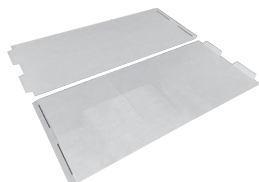
(x2) Side Graphics