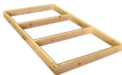
(x1) Wood frame