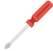
Drill or Screwdriver